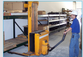
components arrive in the warehouse