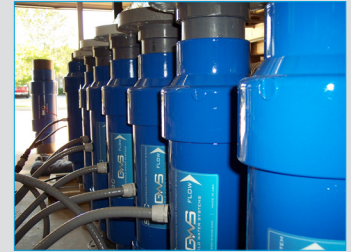
Edge fully assembled