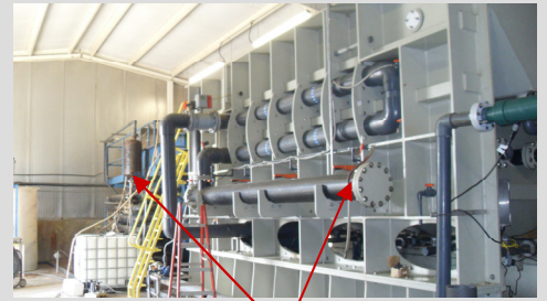
Double DAF Process