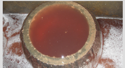
Good Suspended Solids Removal